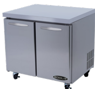
* KUCR-36-2 $3,590 KUCF-36-2 $4,330