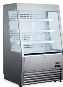
KOM-36SS $6,970 KOM-48SS $9,240