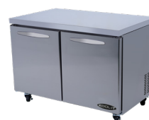
* KUCR-48-2 $3,960 KUCF-48-2 $4,760