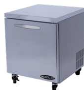
* KUCR-27-1 $2,890 KUCF-27-1 $3,330