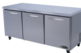
* KUCR-72-3 $5,150

KUCR series can be ordered with drawers. For prices, please call MVP sales office