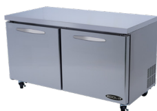
* KUCR-60-2 $4,460 KUCF-60-2 $5,470